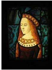
Cecily of York (1469 – 1507)

http://www.historyextra.com/article/people-history/elizabeth-york-one-englands-most-successful-queens?