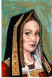
Elizabeth of York (1466 – 1503)

http://www.historyextra.com/article/people-history/elizabeth-york-one-englands-most-successful-queens?